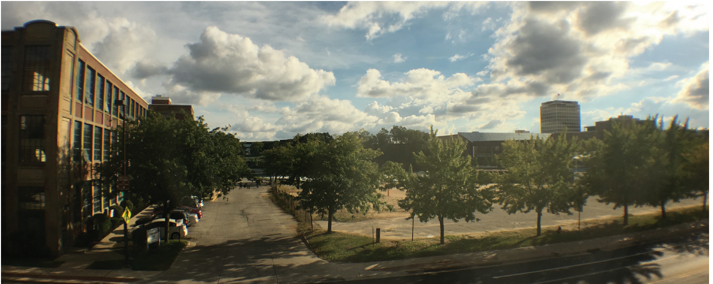
(View from window in Suite 206 lobby)